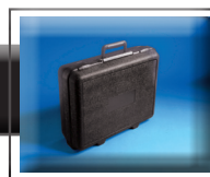
C-200 Carrying Case