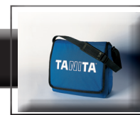
C-400 Carrying Case