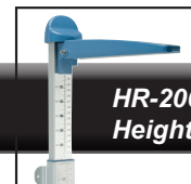
HR-200 Height Rod